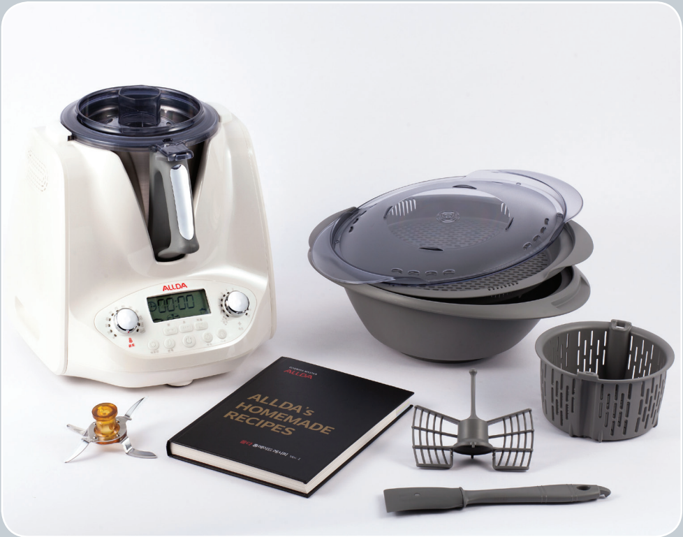
The main body, steamer (steamer plate, steamer lid), cooking bowl, bowl lid, measuring cup, cooking basket, whisk, spatula ,blade, recipe book